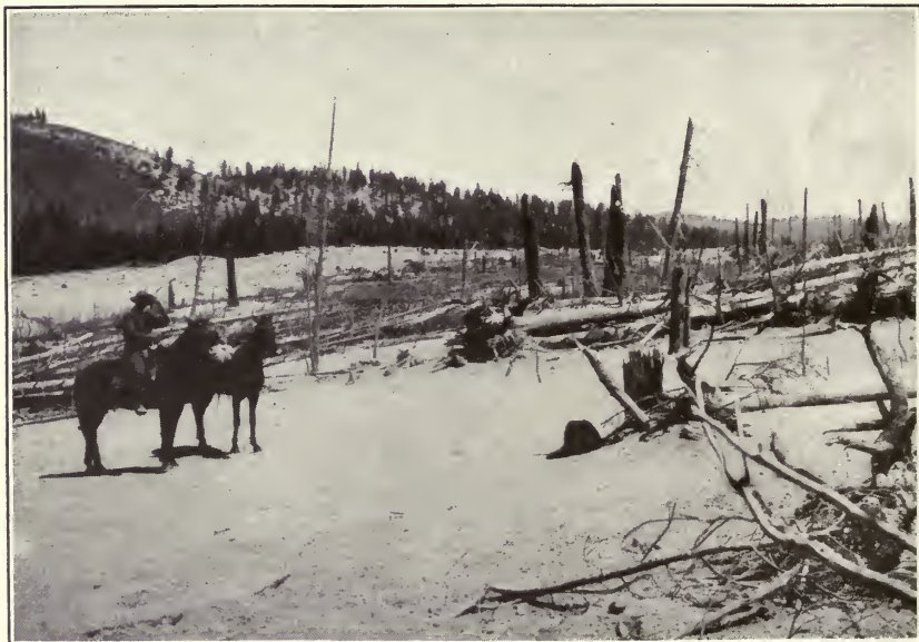
FIG. 5.—The divide between Lost Creek and Hat Creek after the hot blasts uprooted the trees and scoured them with flying sand. On the border of the devastated area the green leaves of the pines were scared and locally scorched by the hot gasses to a distance of more than 2 miles from the crater.

There were two hot blast eruptions into the Hat Creek country; one on the night of May 19 and the other on the afternoon of May 22.